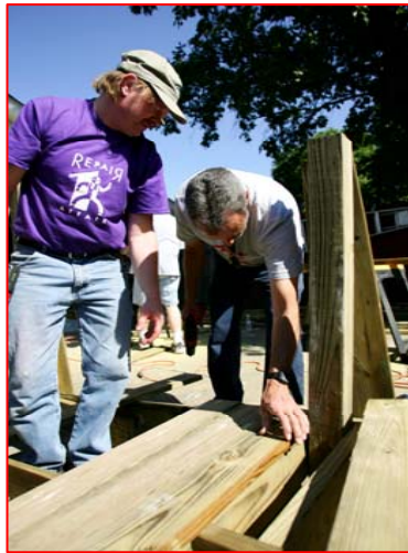
Repair Affair volunteers build a wheelchair ramp.

Repair Affair celebrated its 10th year in Southern Indiana and its 12th year in Jefferson County.